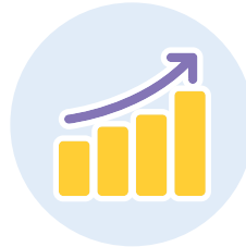
Flexibility and Scalability