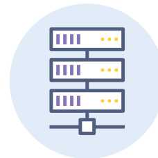
Faster VPN Access