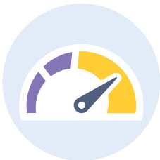
Faster File Uploads and Downloads