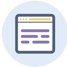
Application and Data Integration