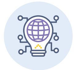
Future-Proof for Today and Tomorrow