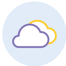
Cloud Services Usable Without Constraints