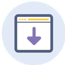
Transfer Large Amounts of Data – Faster