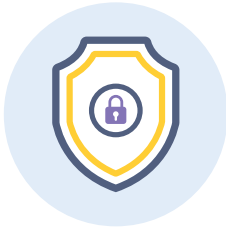
Security, Compliance, Sovereignty